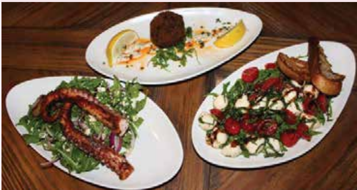
Appetizer trio with Spanish Octopus (left), Crab Cake, and Petite Caprese salad.